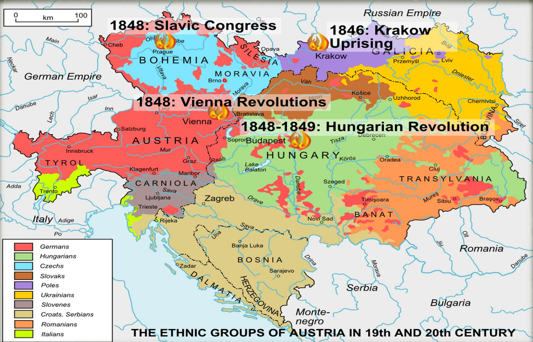
THE ETHNIC GROUPS OF AUSTRIA IN 19th AND 20th CENTURY